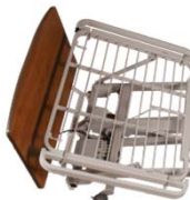
42" Bed Width Kit