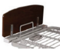
4" Bed Extender