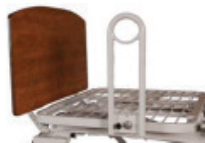
Pivoting Assist Bars