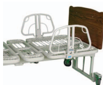
¼ Length Side Rail