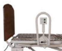
Pivoting Assist Bars with Fixed Handset