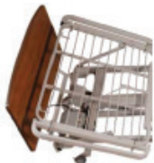
42" Bed Width Kit