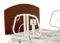
¼ Length Side Rail with Fixed Controls