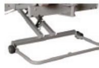
Floor Bumper Guard