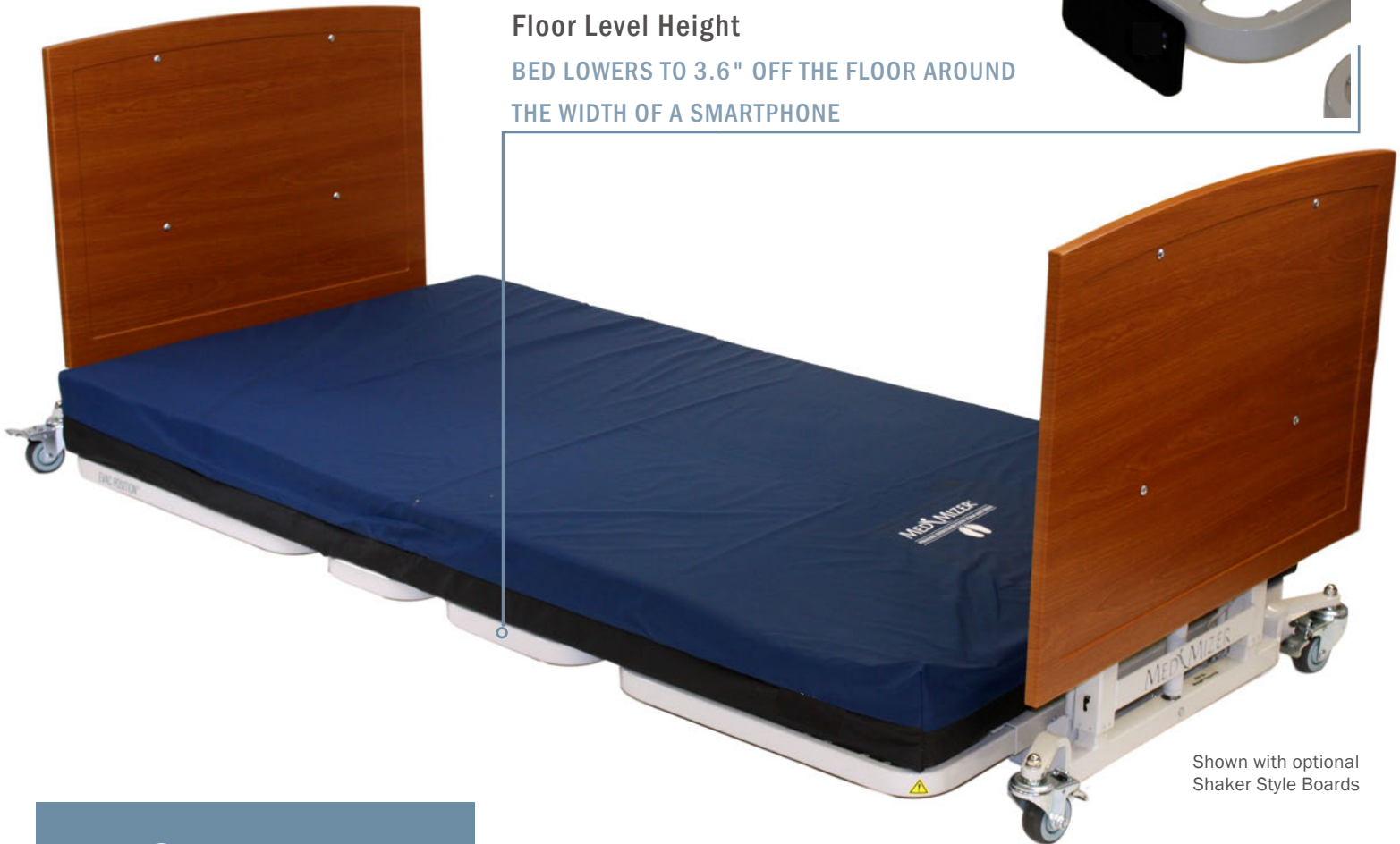
Shown with optional Shaker Style Boards